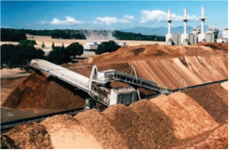
A Northern California biofuel plant turns wood chips and agricultural waste into clean energy.

“One of the best ways to address climate change is to use more wood, not less. Every wood substitute – including steel, plastic and cement – requires far more energy to produce than lumber.”