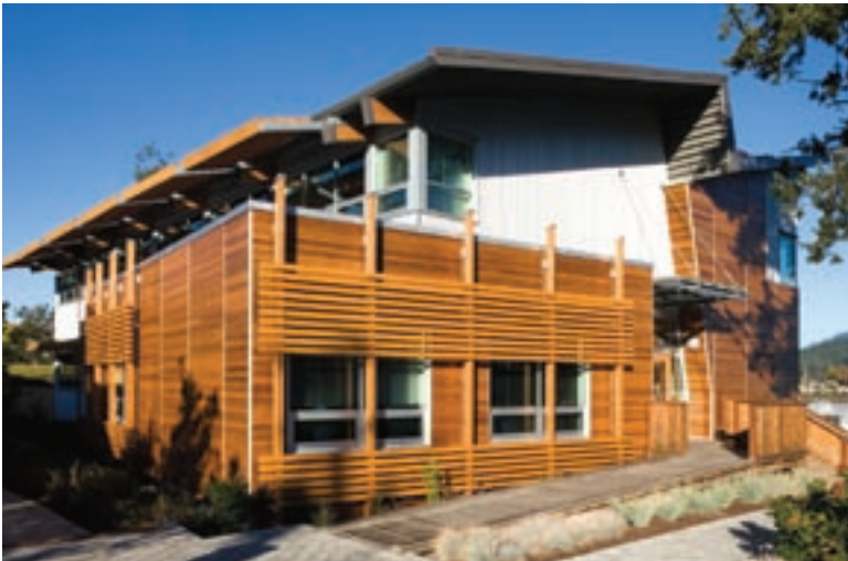
The Gulf Islands Operations Centre designed by Larry McFarland Architects, Ltd is the first building in Canada to achieve a LEED Platinum rating.

Rather than offering architects and builders only an extensive laundry list of voluntary green options as most existing guidelines do, the state is also creating a list of mandatory requirements, such as low-flush