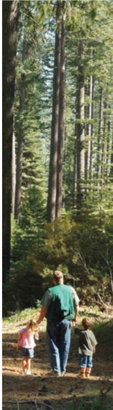
Managing forests can conserve critical resources for generations.

Biofuel energy means burning wood and other organic materials – chips, agricultural waste, bark, sawdust – to produce steam. The steam drives a turbine, which turns a generator to create electricity. Biofuel