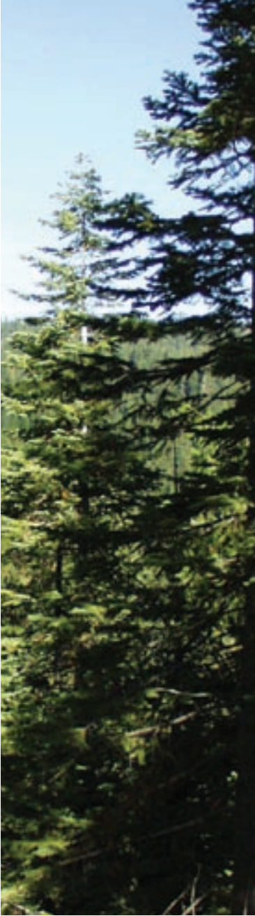
Managed forests remove carbon dioxide from the air. Wood stores the carbon, keeping it out of the atmosphere for the long haul.