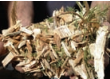
Biofuels can help California meet its growing demand for energy.

energy results in relatively low emissions, whereas burning fossil fuels results in significant carbon emissions. The U.S. Environmental Protection Agency considers biofuel emissions to